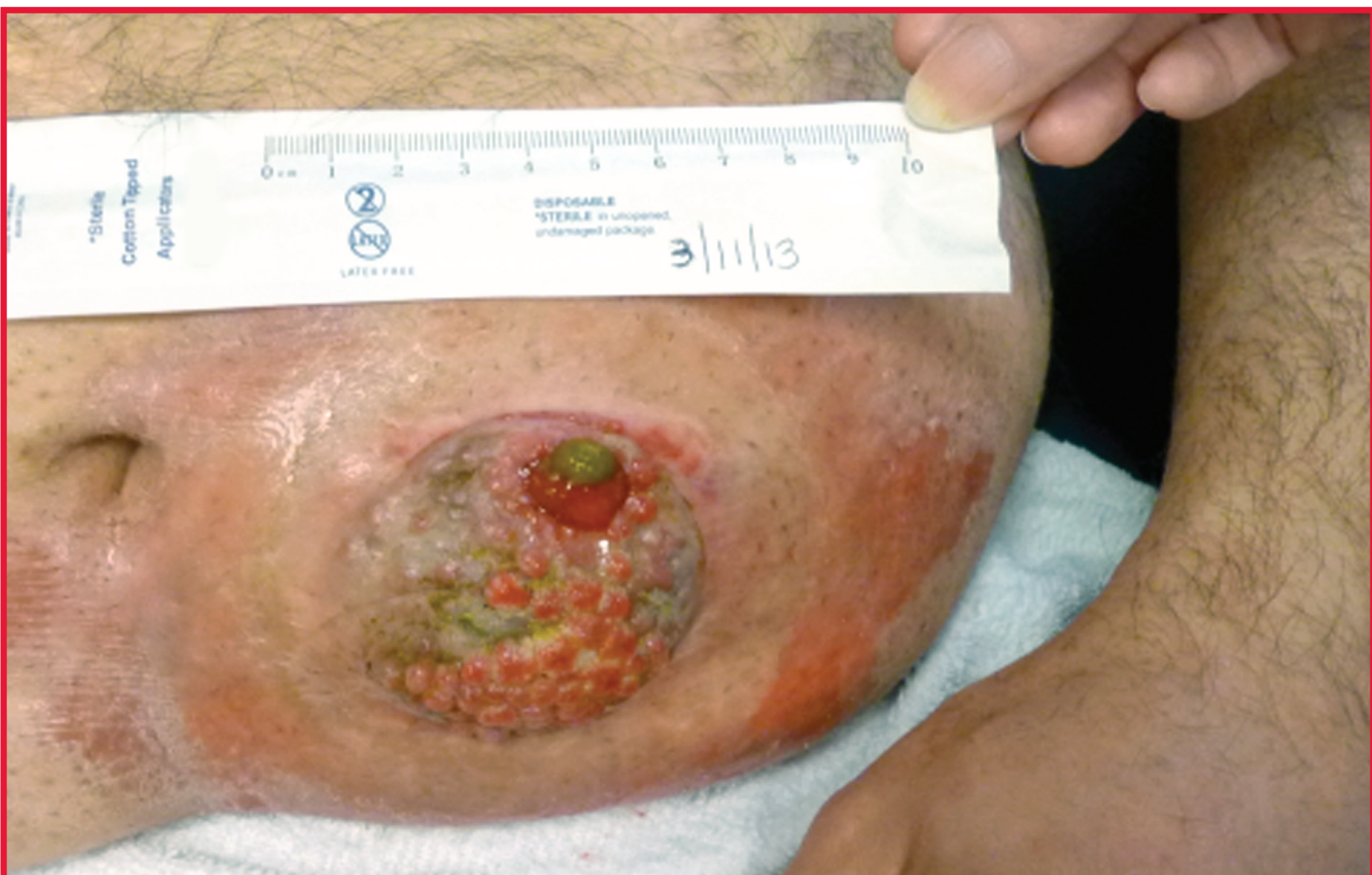
Case 1, Photo 1

An ileostomy patient presented with pseudoverrucous lesions, irritant contact dermatitis, stoma stenosis, and perastomal hernia. He used a two-piece pre-sized, convex pouching system and changed every three days. Ostomy accessories that were used included: stoma powder, barrier prep, skin barrier rings, and a skin barrier sheet. A one-piece pouching system was used and initially changed every other day. On day eight, the patient stated he was able to wear his seat belt without pain for the first time in many years. The patient's skin returned to normal with permanent discoloration but absence of pseudoverrucous lesions.