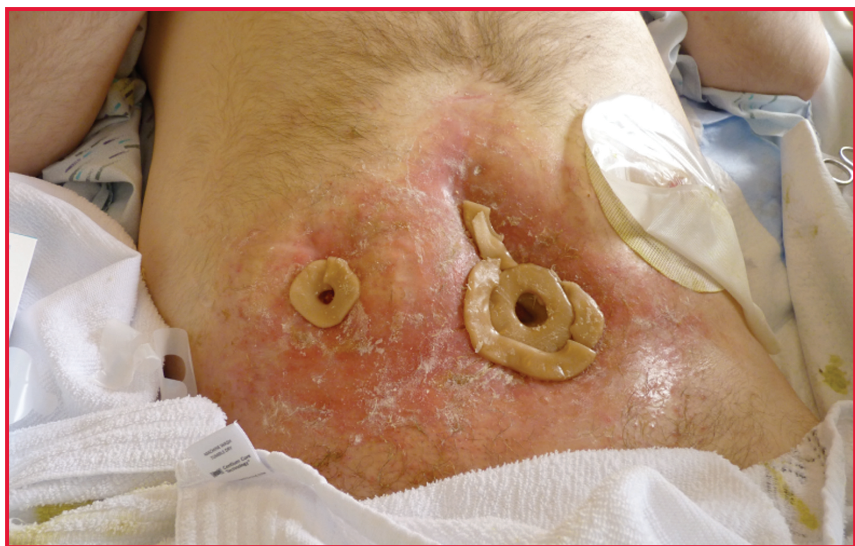
Case 3, Photo 2