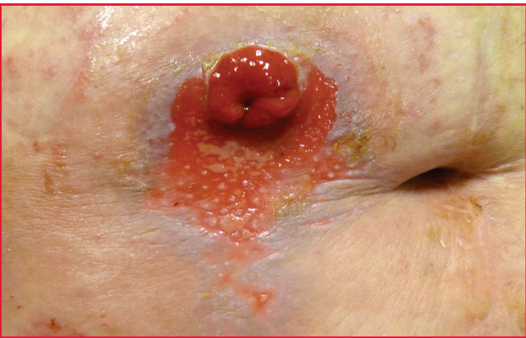
Case 4, Photo 1

A patient presented with peristomal irritant dermatitis. He had a permanent ileostomy done for FAP and had not had a follow-up visit with the WOC nurse since his discharge 10 years ago. Accessories used included stoma powder and barrier prep. The patient was instructed to change pouch prior to leakage. His wear time went from five days to three days but the peristomal skin erosion resolved and he experienced less pain/discomfort.