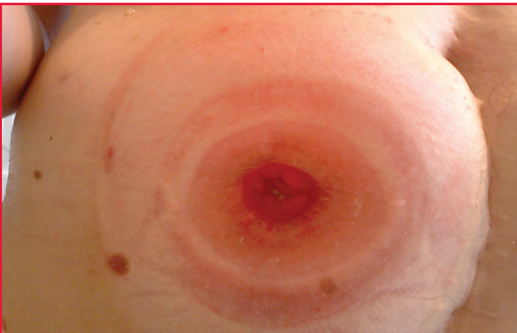
Case 2, Photo 1

An ostomy accessory was used with a challenging stoma and abdomen. The addition of a skin barrier ring helped to fill in an uneven area of scarring. Wear time increased from 2 days to 4-5 days with an improvement in the peristomal skin.