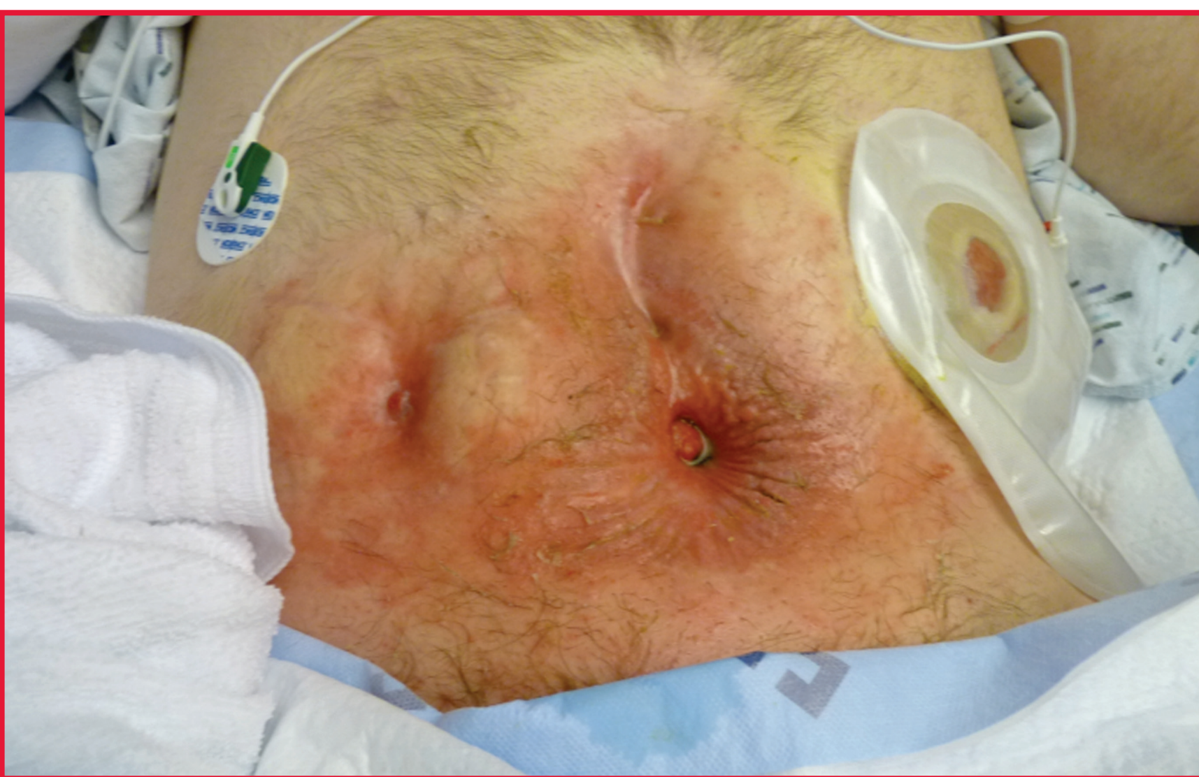
Case 3, Photo 1

The use of skin barrier rings around several high output abdominal fistulas resulted in an improvement in skin redness and irritation. The skin was protected from contact with the drainage and there were less frequent pouch changes.