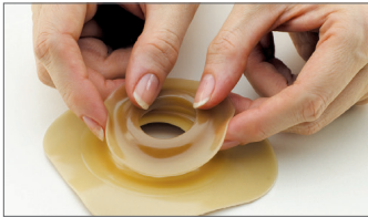
Integrated Convex Barrier with Round or Oval Convex Barrier Ring