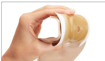
Integrated Soft Convex Barrier