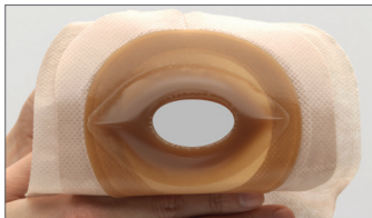
Flat Skin Barrier with Round or Oval Convex Barrier Ring