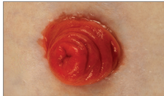
Flat Skin Barrier