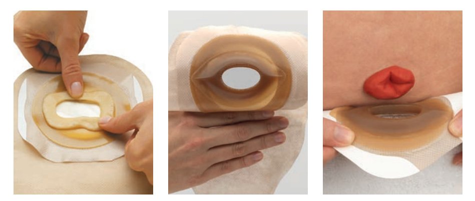
Stretch and shape seal for a customised fit.

Apply flat or convex CeraRing<sup>™</sup> seal to the adhesive side of your skin barrier.